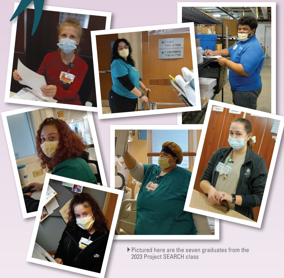
▶ Pictured here are the seven graduates from the 2023 Project SEARCH class

On May 19, Penn Medicine Lancaster General Health celebrated the class of 2023 graduates of the Project SEARCH program. Project SEARCH is an internship program at LG Health that provides work, social and life skills to local high school seniors with intellectual challenges. Through the program, students gain confidence, independence and experience as they reach for their goal of employment at Lancaster General Hospital (LGH) or within the broader Lancaster community after graduation.